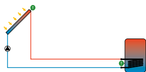
Internal heat exchanger, intelligent pump control