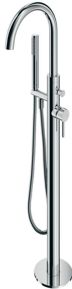
Tall floor-standing bath mixer Y1233#