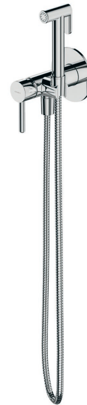
Bidet system SYSYBI2#