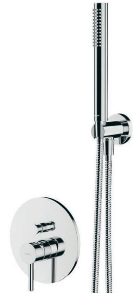
Bath system SYSYW01#