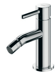
Bidet mixer Y1220#