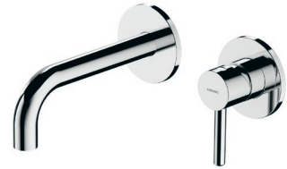
Basin mixer Y1215H#