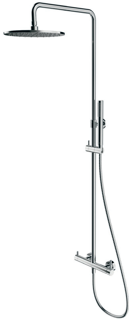
Shower system Y1244M#