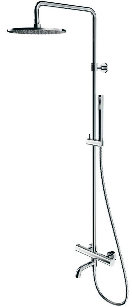
Shower system SYSY22X# SYSY35# SYSY19# SYSY18# SYSY16#