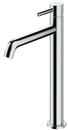
Tall basin mixer Y1212#