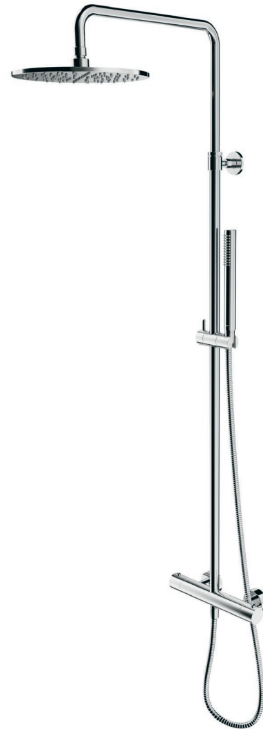
Thermostatic shower system Y1244SU#