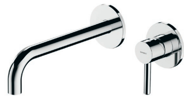
Basin mixer with long spout Y1215HL#