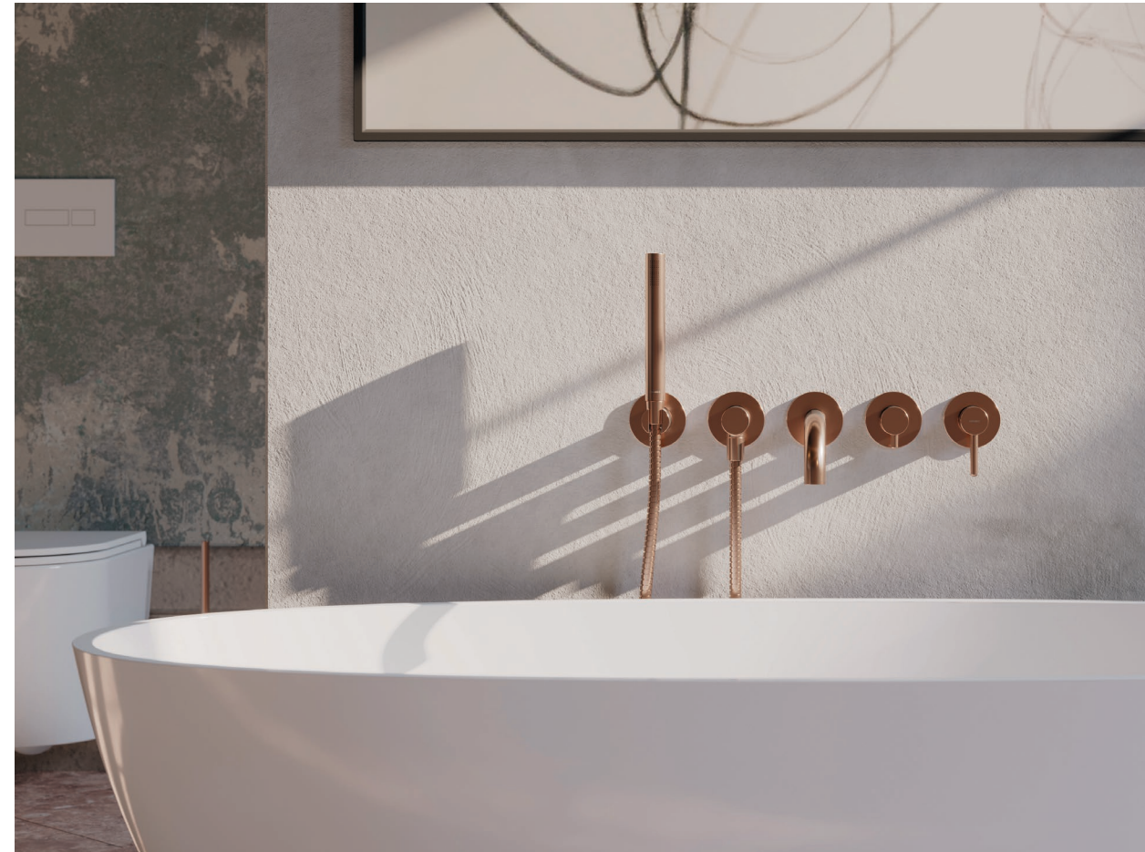
The 5-hole bath mixer was carefully designed to ensure its perfect symmetry and harmonious form. The precisely proportioned shape beautifully complements the bath, while the concealed installation method guarantees space efficiency. The design won the main prize at the Dobry Wzór competition.