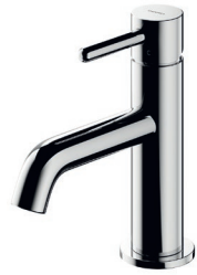
Basin mixer Y1210N#