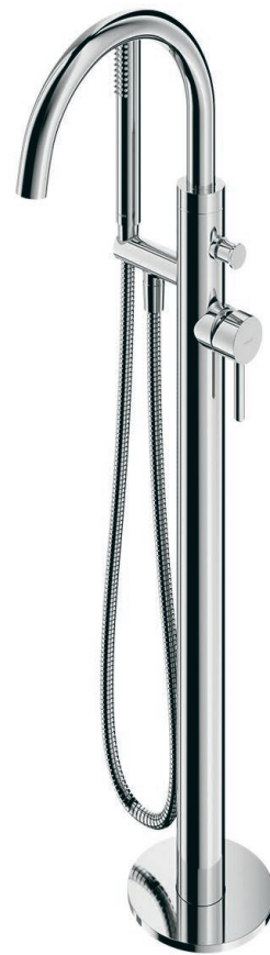
Floor-standing bath mixer Y1233-S#