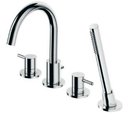
4-hole bath mixer Y1232#