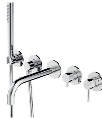
5-hole bath mixer with long spout Y1237-1#