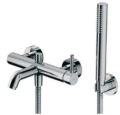
Bath mixer with a shower set Y1231#