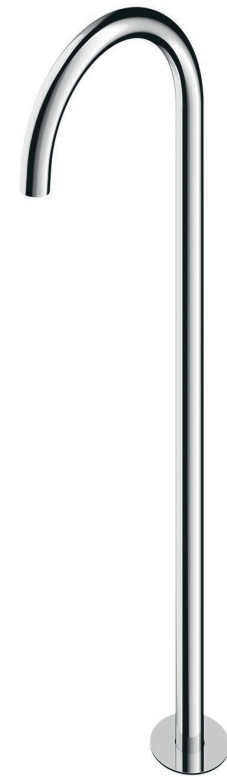
Floor-standing bath spout WWY#